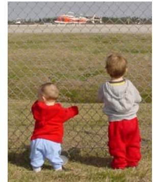
Joe and Caleb watching student helicopter pilots at Naval Air Station Whiting Field, FL. Did you know that daddy used to fly those things?