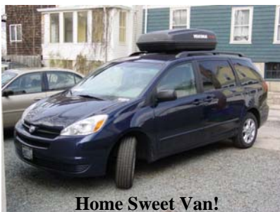
Home Sweet Van!

One of the features the Toyota salesman hyped about the van we bought last summer was its “run flat” tires – no spare needed or included. We were a bit skeptical at first, but boy oh boy were we thankful for them at the end of February, during a rush hour rainstorm as we left Montgomery. Upon consulting the owner’s manual, we learned that the unfamiliar caution light meant “Low Tire Pressure”. We drove to a service station and were surprised to learn that we had taken a nail and the front left tire was completely flat. We couldn’t even tell which tire was flat until we checked the pressure with a tire gage! The idea of standing in the pouring rain unpacking the insane amount of luggage jammed into the back of the van to get to a spare still makes us shudder. Thanks God for sparing us from that!